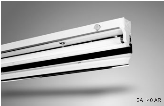
SA 140 AR

Suitable for ceiling or wall mounting. Asymmetrical mirror reflector for directional light distribution. Reflector held securely by treaded nut, offering large screw area using hand for fast installation. Available in different angle reflection. Discrete appearance achieved with adjustable lampholder. End to end continuously mounting from preformed punch out type without additional drilling required. Ideal for wall washer or directional light distribution application.