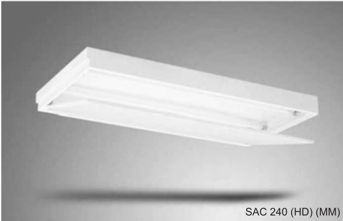
SAC 240 (HD) (MM)

Designed for exposed T-bar ceiling grid. Diffuser designed in normal hinged for either side for easy maintenance. Provided even light distribution glare control and maximum light transmission, combined with a very low luminosity at angle approaching the horizontal surface. This range was designed to minimize glare and maximize light output and visual comfort together with a good degree of protection. Suitable for locations where good horizontal illumination is important.