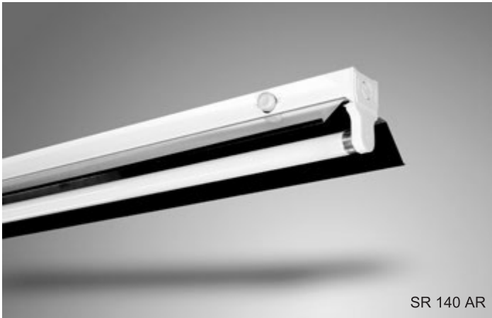
SR 140 AR

Suitable for ceiling mounting or pendant mounting with suspension system. Symmetrical mirror reflector for directional light distribution. Reflector held securely by treaded nut, offering large screw area using hand for fast installation. Allow a wide and efficient direct distribution of light. Discrete appearance achieved with adjustable lampholder. End to end continuously mounting from preformed punch out type without additional drilling required. Ideal for direct wide distribution application.