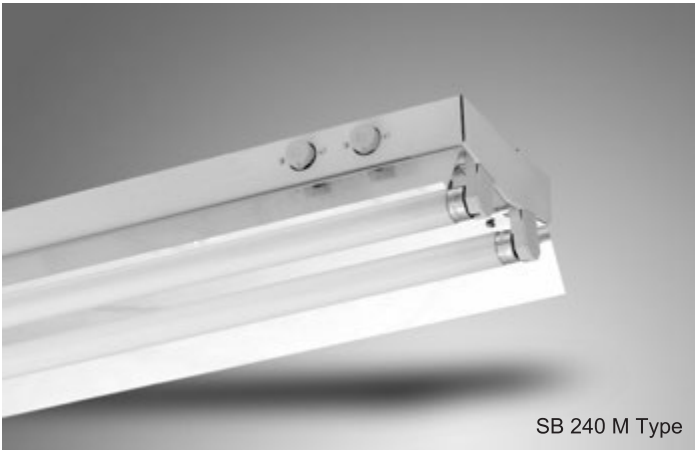
SB 240 M Type

Suitable for ceiling or pendant mounting with suspension system. Mirror reflector held securely by treaded nut, offering large screw area using hand for fast installation. Allow a wide and efficient distribution of light. End to end continuously mounting from performed punch out type without additional drilling required. Recommended for use where lighting needs to be concentrated on certain areas.