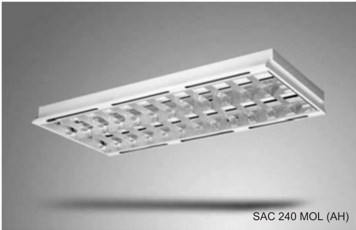
SAC 240 MOL (AH)

Designed for recess imperial exposed T-bar ceiling mounting with single parabolic mirror optic louvre with christmas profile cross blades. The fixture is included the air handling for the air supply outlet circulation. Louvres can be lowered and hang out from either side. Double parabolic mirror asc upon requisition. Mainly used for general lighting in offices, supermarkets and complexes.