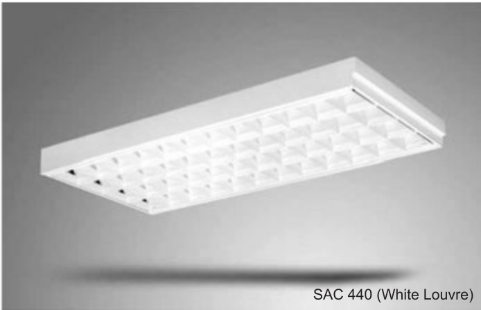
SAC 440 (White Louvre)

Designed for recess mounting with white painted single parabolic optic louvre for wide diffuse angle light distribution. Louvres reflection by means of slide lock set and can be lowered and hang from either side. Mainly use for general lighting in offices, supermarkets & complexes.