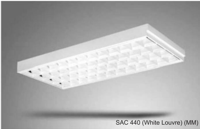
SAC 440 (White Louvre) (MM)

Designed for recess mounting with white painted single parabolic opric louvre for wide diffuse angle light distribution. Louvres reflection by means of slide lock set and can be lowered and hang from either side. Mainly use for general lighting in offices, supermarkets & complexes.