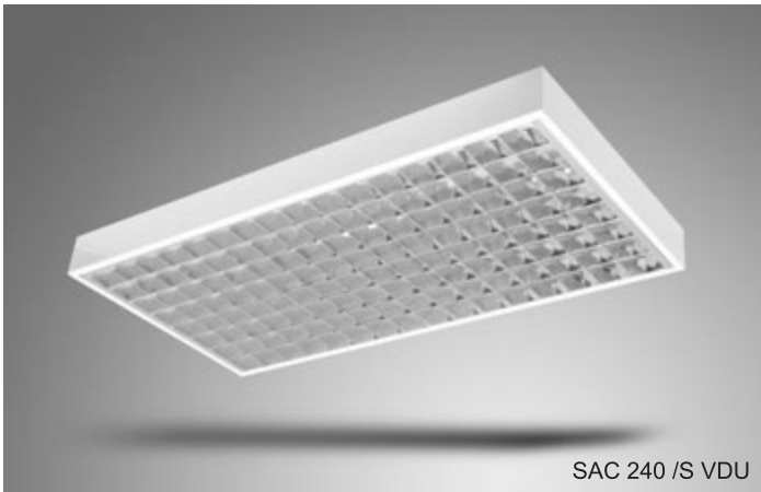
SAC 240 /S VDU

Fully complete with light distribution requirement of CIBSE LG3 CATEGORY 2. Designed for direct mounting to ceiling with double parabolic mirror optic louvre. Louvres manufactured by flexible manufacturing system (FMS) for precise, accuracy and optimized product performance. Mainly used for general lighting in offices, supermarkets and complexes.