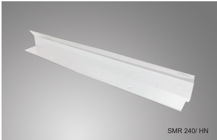
SMR 240/ HN

Various lengths to suit individual needs.