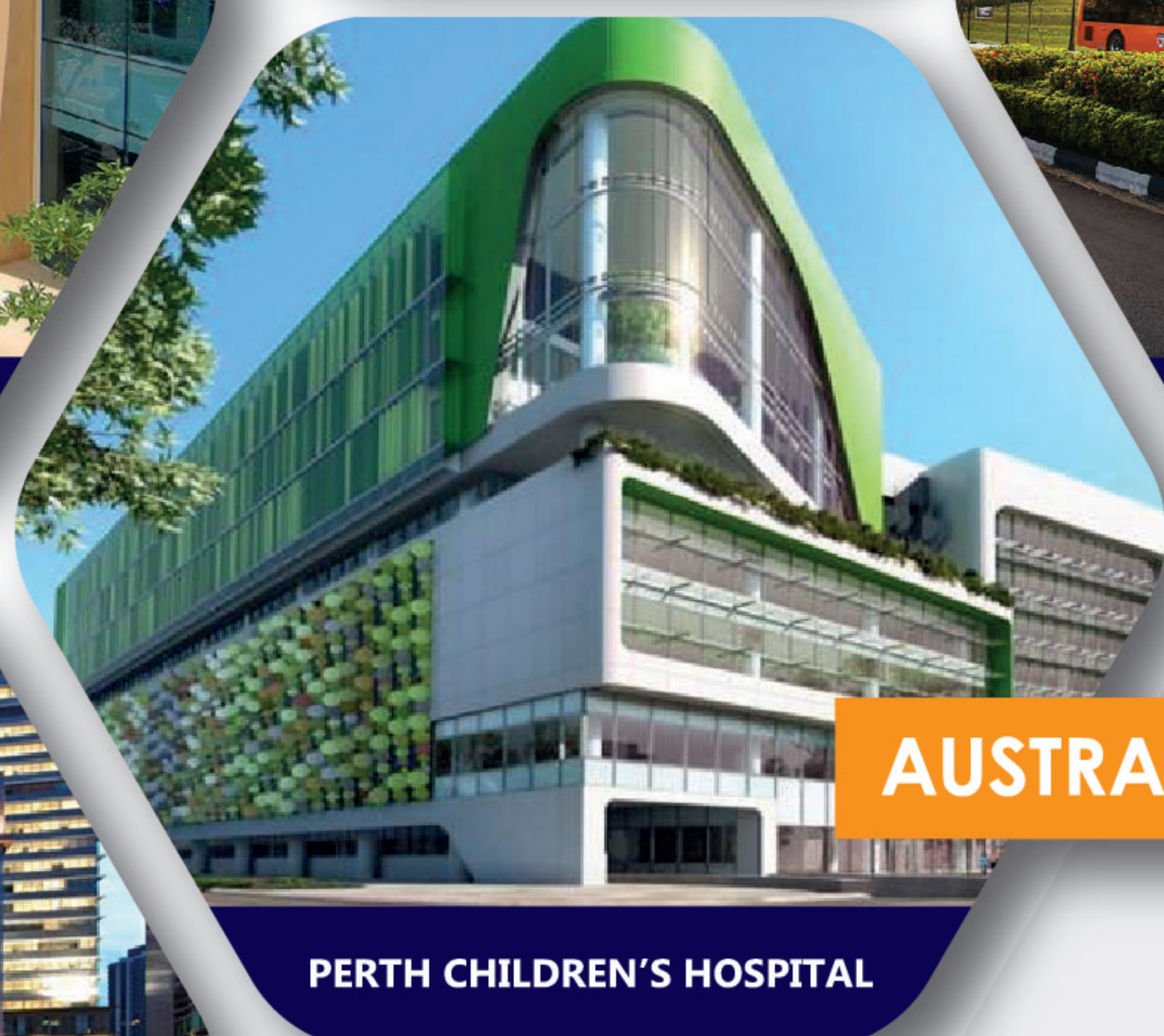
PERTH CHILDREN'S HOSPITAL