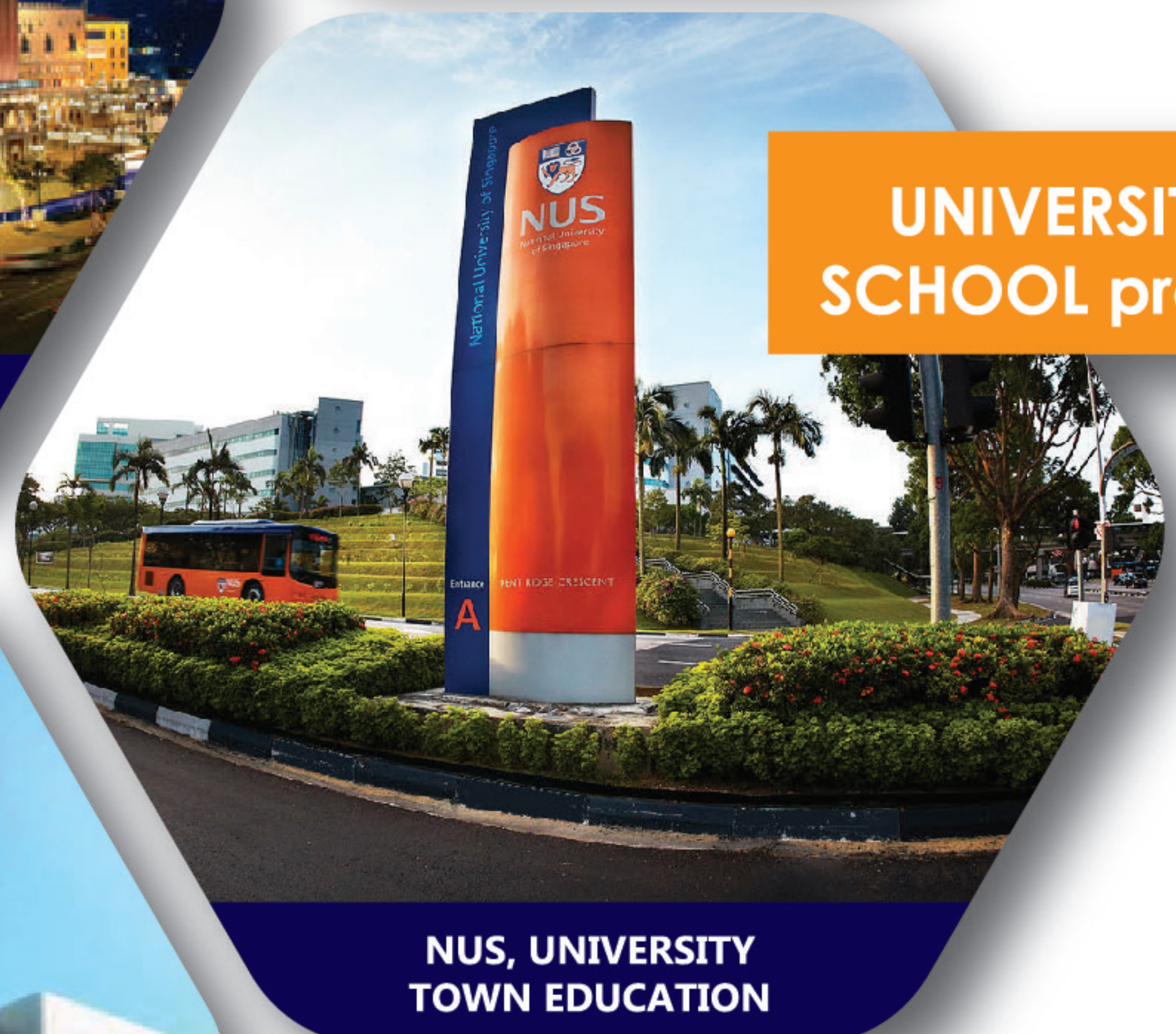
NUS, UNIVERSITY TOWN EDUCATION