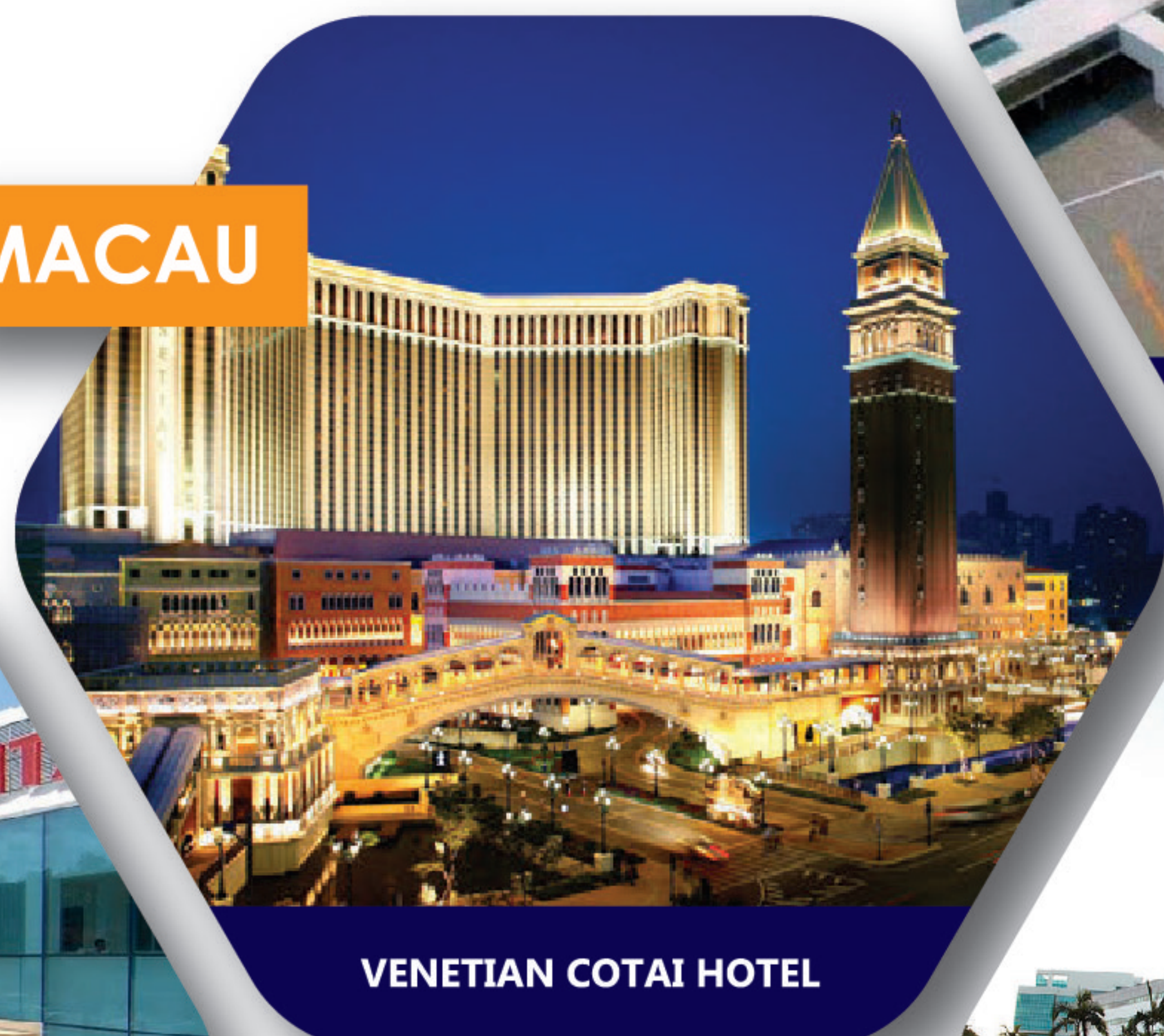
VENETIAN COTAI HOTEL