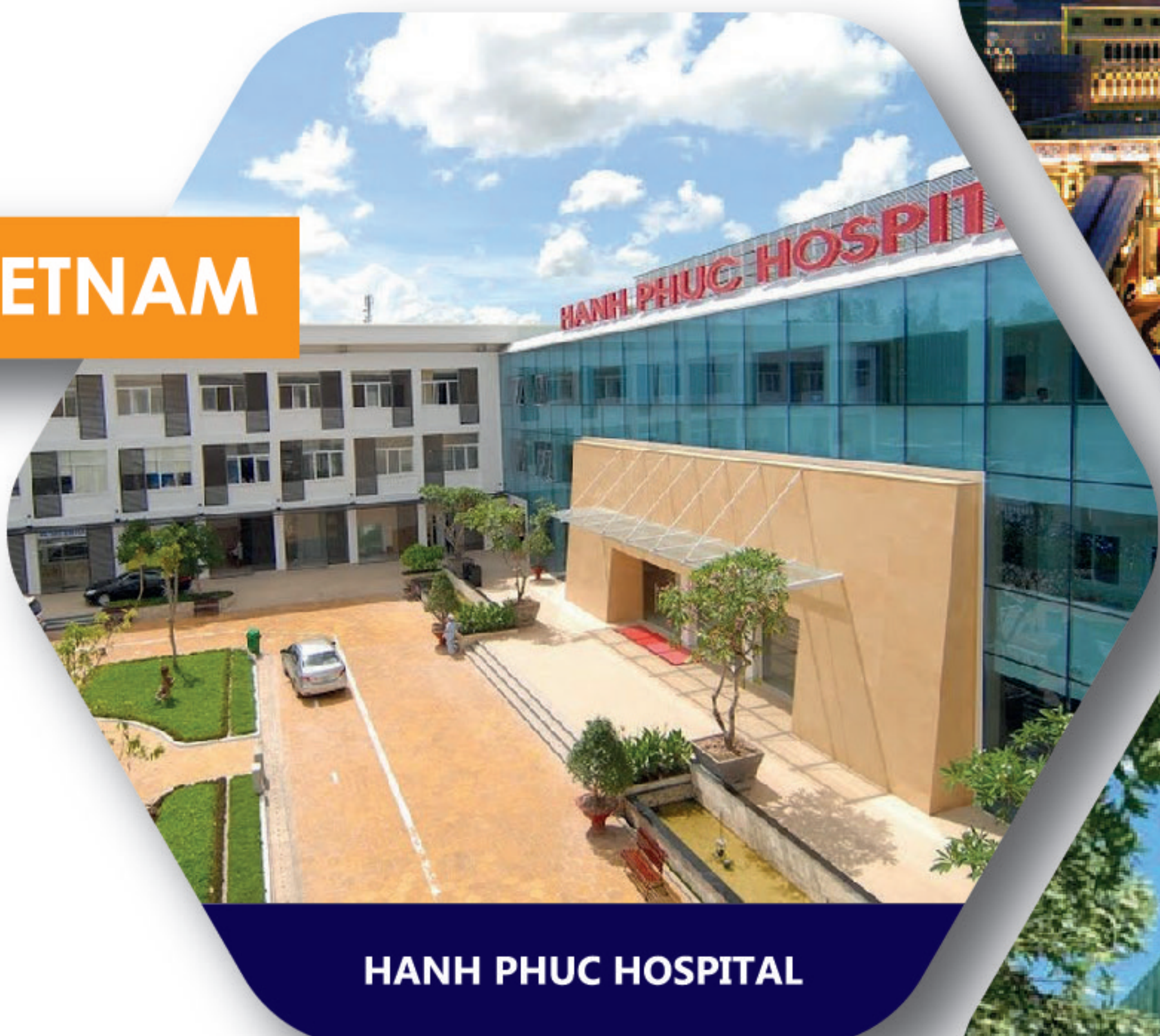
HANH PHUC HOSPITAL