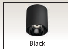
Range of interchangeable reflector